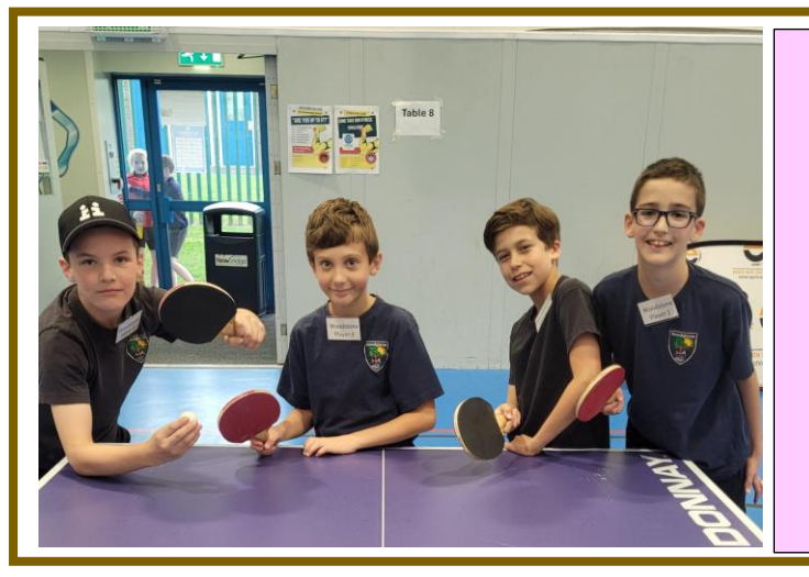
TABLE TENNIS HISTORY

History was made last week when this team of four table tennis players became the first children EVER from Woodstone to take part in an inter school table tennis competition. The boys all played really well – winning some games and losing others but they all really enjoyed it. Well done boys!