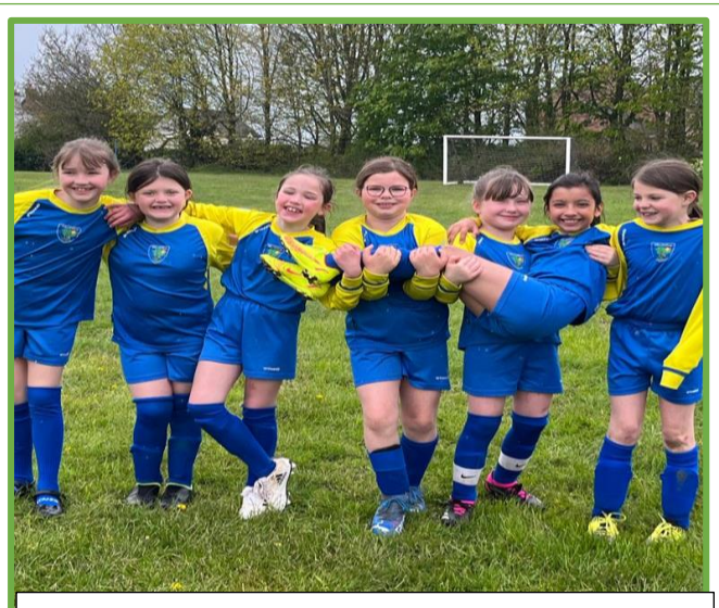
Faith from Year 4 also played but is not on the picture

It's been fantastic to watch the rise of the women's game in English football. It has certainly inspired a whole new generation of girls to take up the sport. Here at Woodstone we have never seen so many girls wanting to play. Over the last week we have fielded two girls teams in a new tournament aimed at schools in our area.